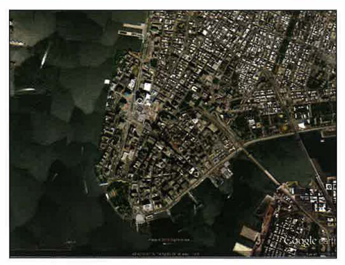
A satellite image of lower Manhattan captures the human and physical processes that give character to this place. Streets, highways, bridges, tunnels, ferries, and rivers are all part of the spatial pattern of transportation in New York City.