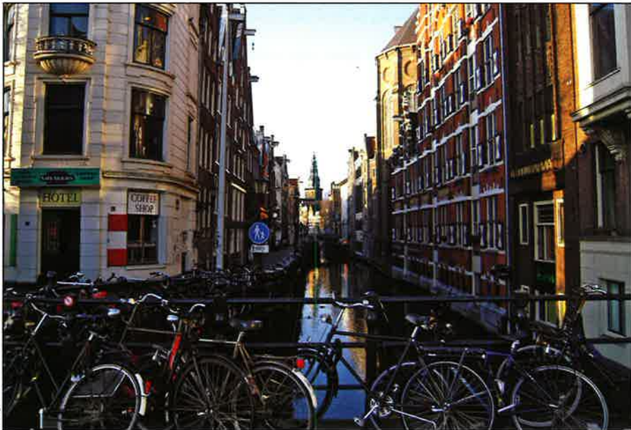
The people of Amsterdam have a long history of using dikes and canals to control flooding and reclaim land from the sea. Canals and bicycles are practical forms of transportation in a city with limited land area and flat terrain.