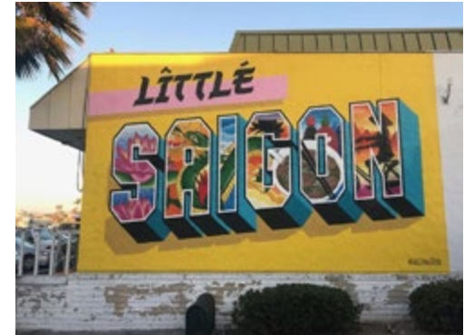
Image: Immigrants to California have established diverse types of neighborhoods all over the state, such as Chinatown in San Francisco, Little Armenia in Los Angeles, and Little Saigon in San Diego (pictured here).

As the map shows, these new Californians live in every county of the state, though the greatest number are living in large cities. They work in every type of job, and many attend schools, colleges, and universities. Immigrants add to the diversity of people that make up America's ever-growing population.